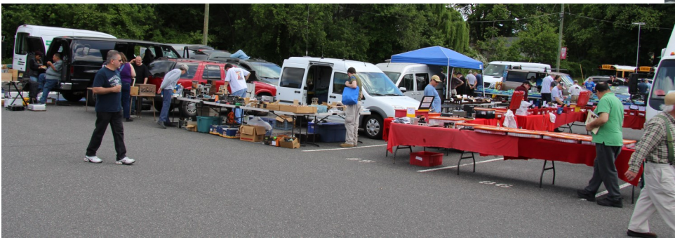
BARA Hamfest May 2017