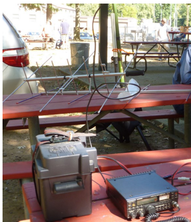
VHF Station with Satellite antenna