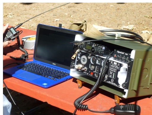
Digital via RF