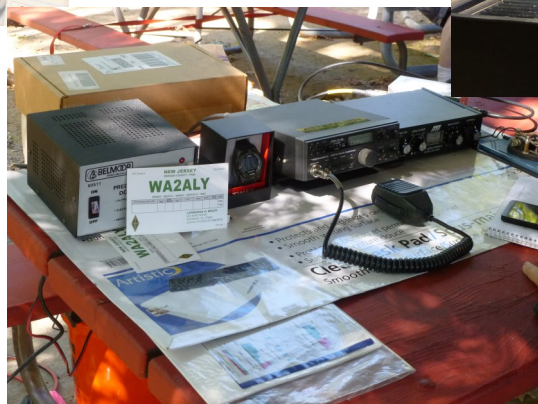
WAZALY 10M Station