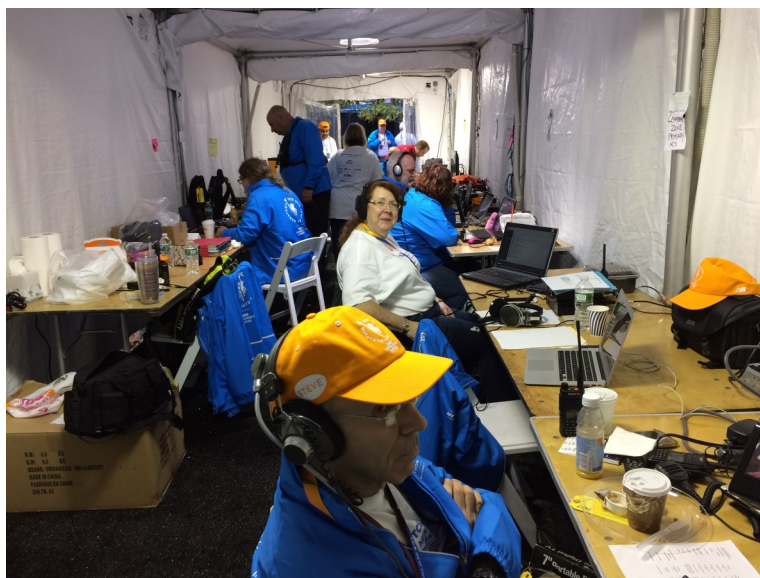
Ham Radio Command Tent at the 2017 NYC Marathon.

160 meter 1/4 wave, inverted 'L' antenna, and the DX-88, nine (9) band vertical sharing the same ground radial plate. The antennas are remotely switched from the shack.